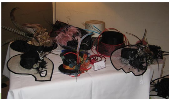
Brielle Hats display by Natelle Dwyer

To view all photos from the function – please click on the following link